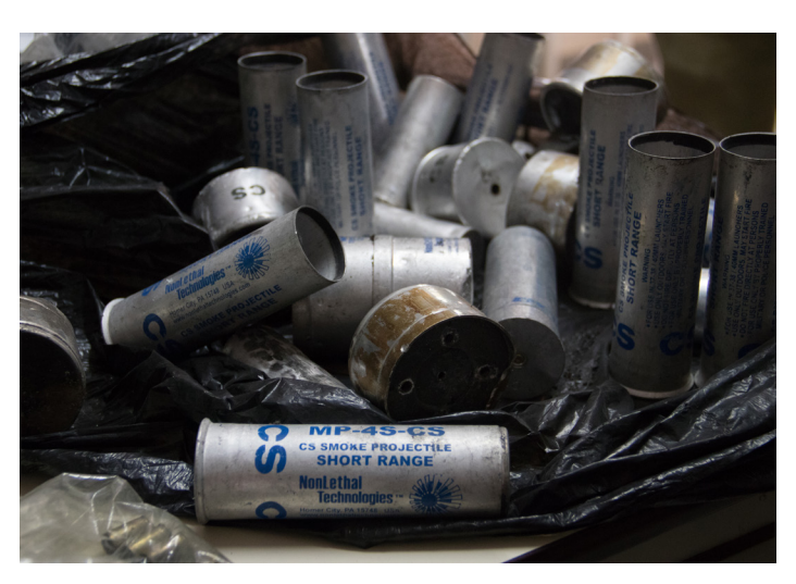
Spent canisters of U.S.-made tear gas used against people protesting alarming irregularities in the 2017 election.

According to Reuters (March 30, 2019), the U.S. provided about $98 million to Honduras in 2016 alone (the latest year on which they have reported). U.S. money continues to fund the militarization of police and security forces, and buys weapons, technology, and surveillance equipment manufactured by U.S companies.