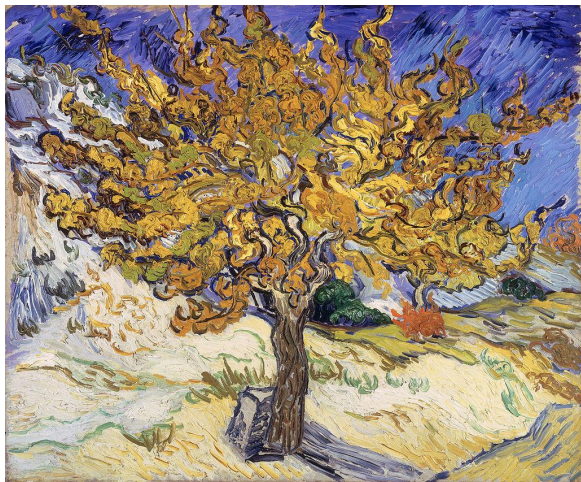
Vincent van Gogh - The Mulberry Tree (1889)

It is hard to move on from the prophet and join the psalmist: “Let us sing joyfully to the LORD.” (Psalm 95:1-2, 6-7, 8-9)