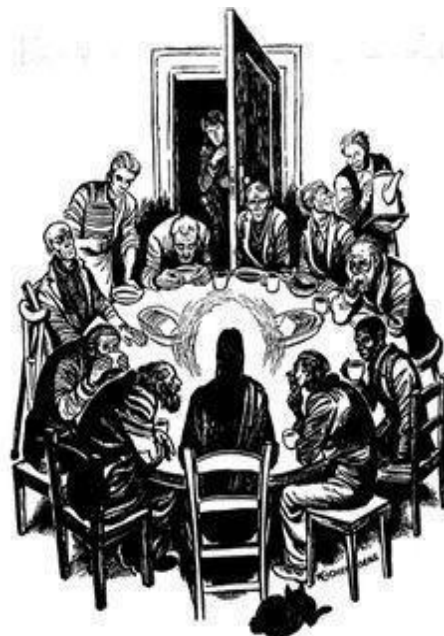
THE LORD'S SUPPER (1953)

Sharing food and drink can help to facilitate conversation and build relationships. However, we also want to be sensitive to people's budgets and time, so we encourage each Circle to decide as a group whether or not they would like to include time to share a snack or something to drink. We would encourage whatever is shared to be simple unless there's a special occasion and it is agreed upon by all.