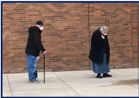
The line to vote in the Wisconsin 2020 Primary Election

People of color are disproportionately burdened with COVID-19 and experience higher death rates compared to white people in the United States. 2 Nationally, Black people are dying of COVID-19 at twice the expected rate based on their share of the national population and Hispanics and Latinos also account for a disproportionate share of cases. 3 Native Americans have also experienced higher rates of COVID-19 with devastating impacts in tribal communities. 4