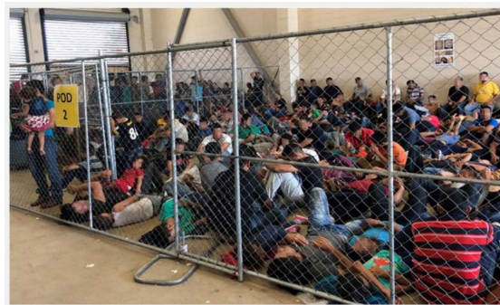
Figure 1. Overcrowding of families observed by OIG on June 10, 2019, at Border Patrol's McAllen, TX, Station.

Images of immigrant and refugee children detained in cages, separated from family members, and living in unsanitary, unhealthy conditions have outraged the nation in recent weeks. The faith community has decried this treatment of children not only as a violation of human dignity and rights, but also as contrary to religious teachings and the sacred call to care for people who are most at risk, especially children.