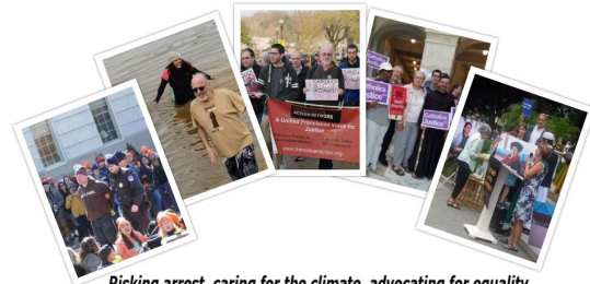
Risking arrest, caring for the climate, advocating for equality, justice, and human dignity for 10 years

The Franciscan Action Network (FAN) is proud to share news of the past year's successes in our 2018 Annual Report . We encourage all of our Institutional and individual members and other members of the Franciscan family to take a moment to read through it as it shares information about the important work that our staff and Board do to foster future success.